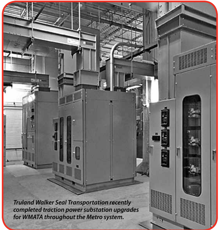
Truland Walker Seal Transportation recently completed traction power substation upgrades for WMATA throughout the Metro system.

“The biggest challenge of transportation electrical work is the elements. You can’t predict the weather and have to work around it.”