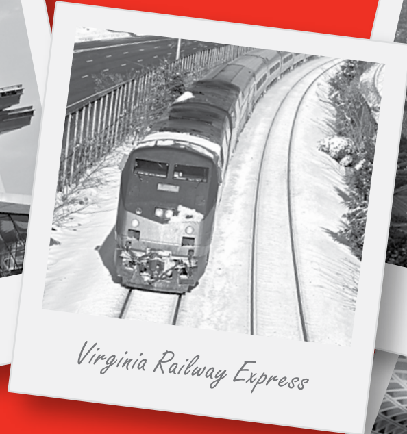
Virginia Railway Express